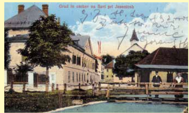
The Ruard family home – manor house (left) in Stara Sava in Jesenice around 1900

+386 4 586 31 78, info@turizem.jesenice.si, www.turizem.jesenice.si