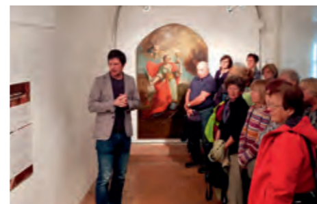
Kosova graščina / Kos Manor