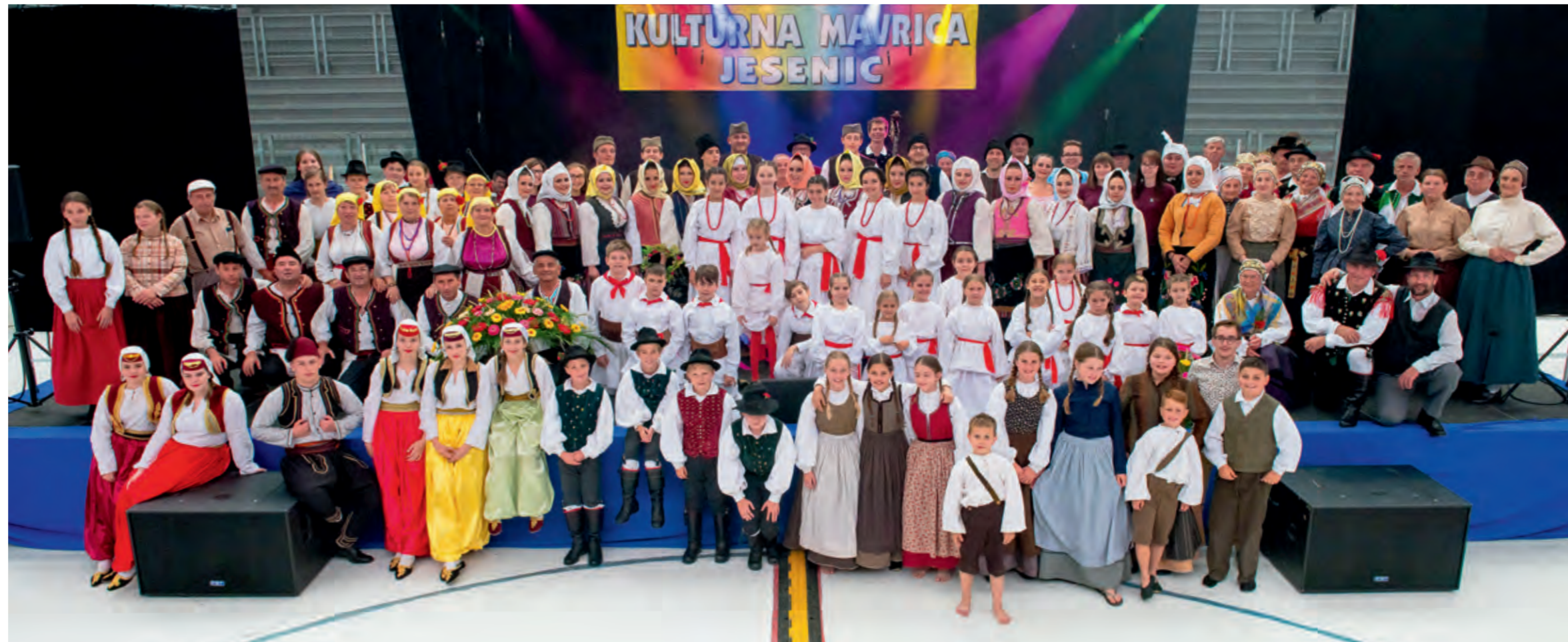
Tradicionalna prireditev Kulturna mavrica Jesenic / The traditional event Jesenice Rainbow of Culture