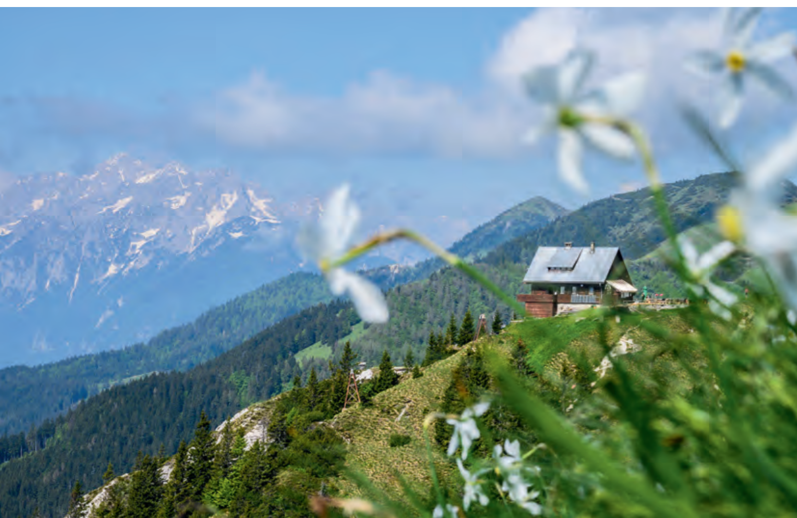
Koča na Golici / Mountain lodge on Mt. Golica (1.582 m)