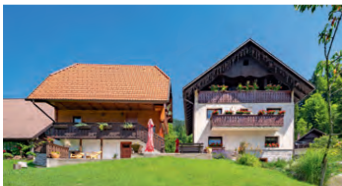
Kmečki turizem Pr' Betel / Agri Tourism Pr' Betel

Obiskovalci in turisti občine Jesenice so dobrodošli v turističnih apartmajih in sobah, v katerih lahko bivajo krajši ali daljši čas.