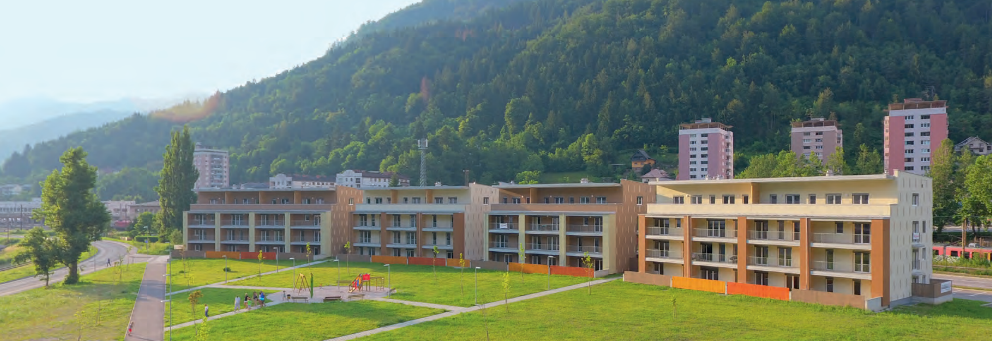
Soseska Sonček / Neighborhood Sonček