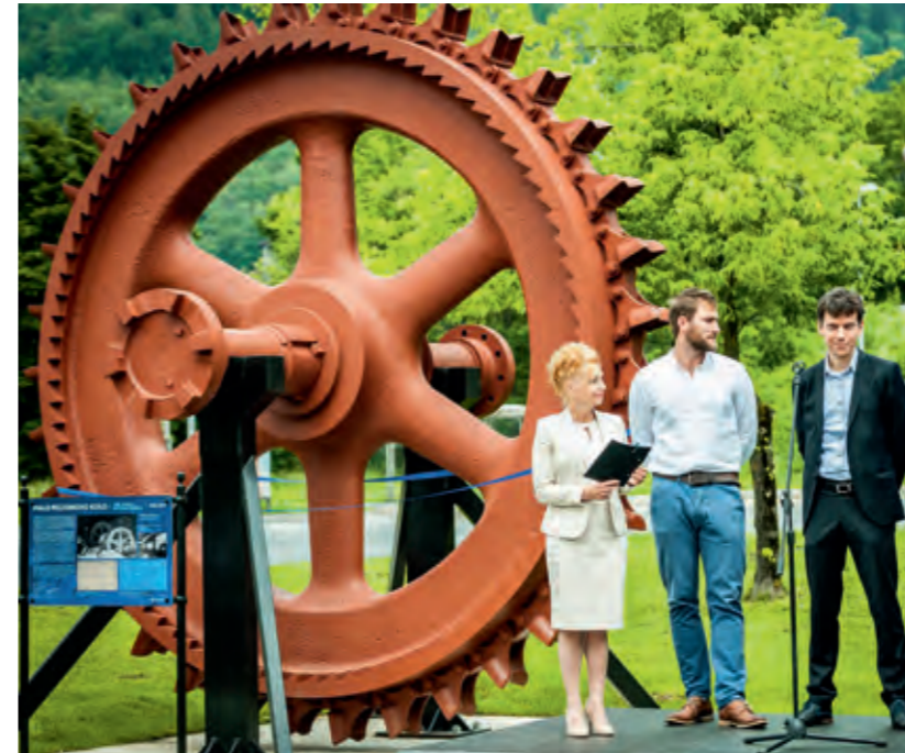
Peltonovo kolo / Pelton Wheel