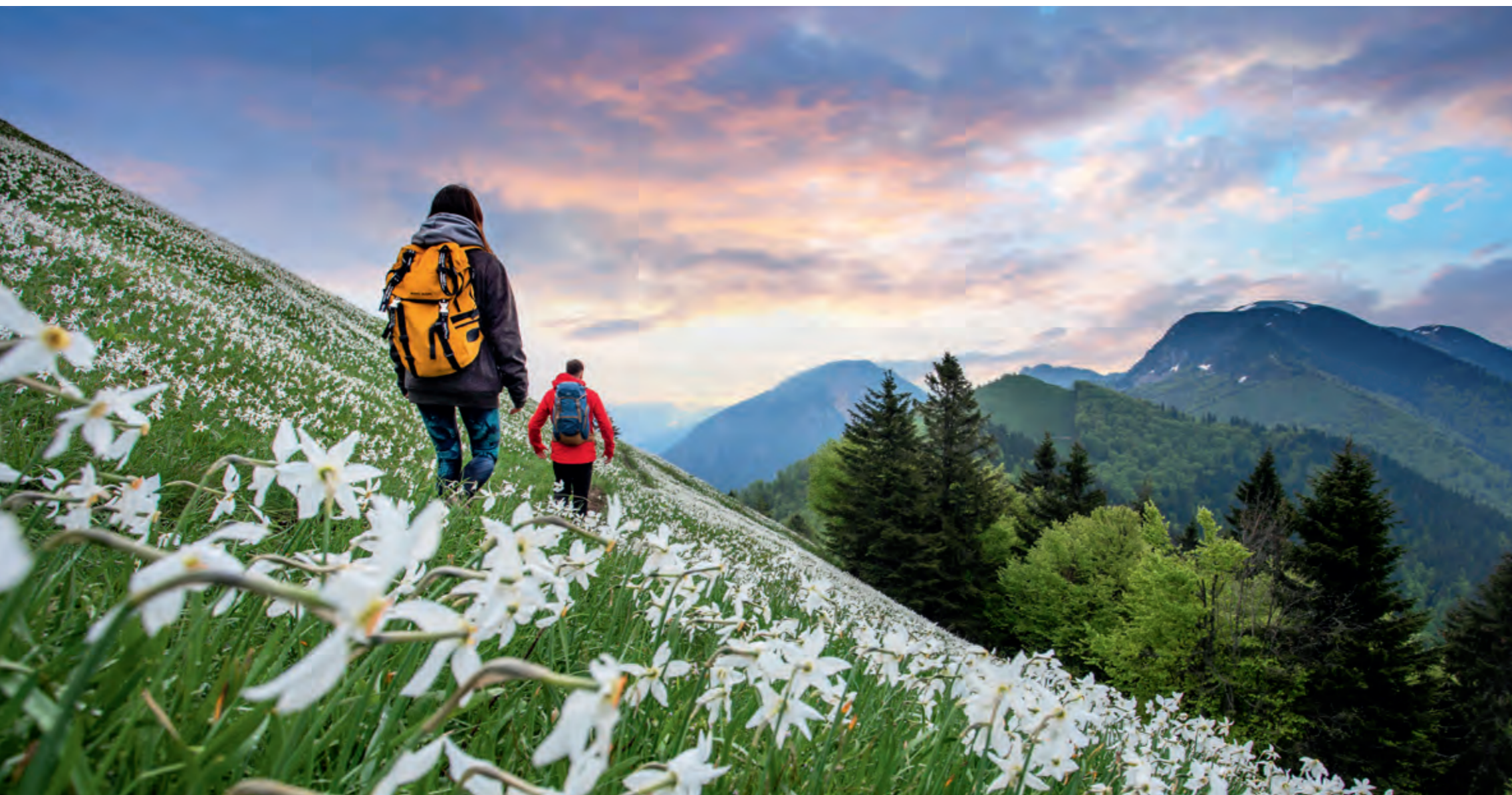
Golica /Mt. Golica

“Le nekaj korakov je potrebnih iz mestnega vrveža v osrčje lepe gorske narave, ki jo ponujajo Karavanke.