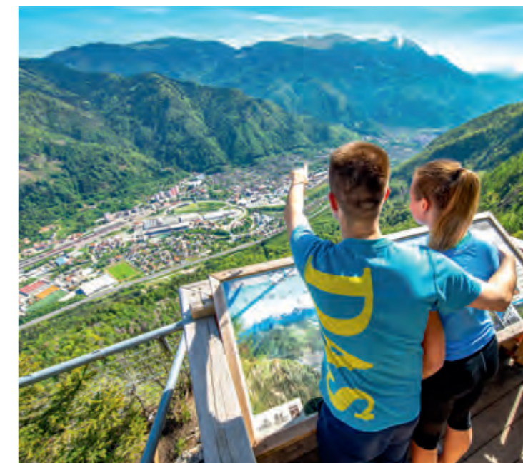
Razgledišče Špica na Mežakli / Viewpoint Špica on Mežakla Hill

Among interesting natural phenomena in the vicinity of Jesenice are numerous waterfalls and the famous Vintgar gorge, also accessible from Blejska Dobrava.