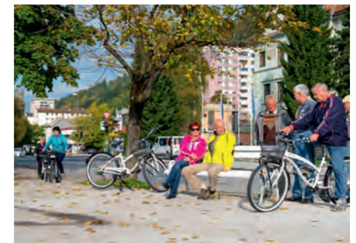
Čufatjev trg / Tone Čufar Square