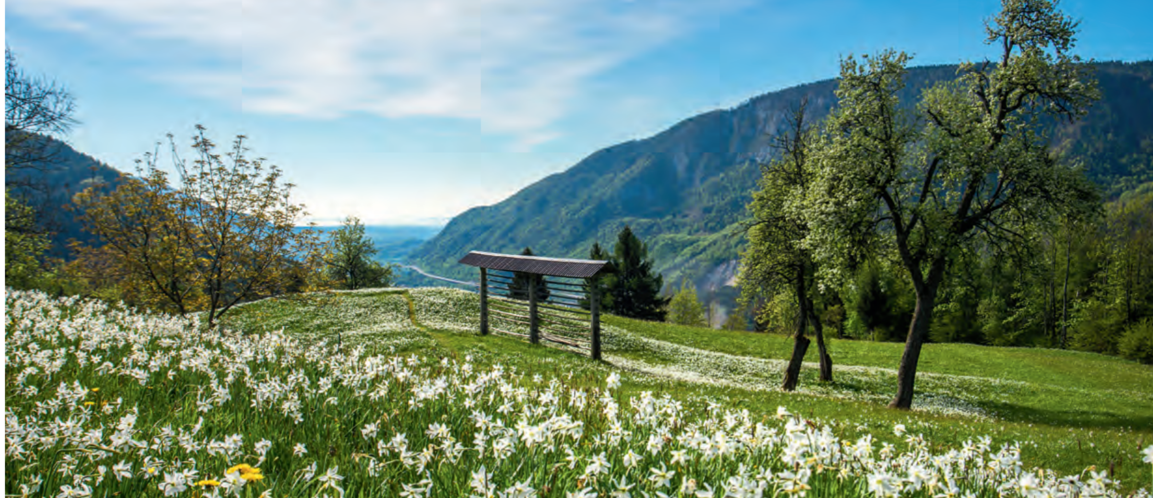
Narcise v Plavškem Rovtu / Daffodils in the village Plavški Rovt