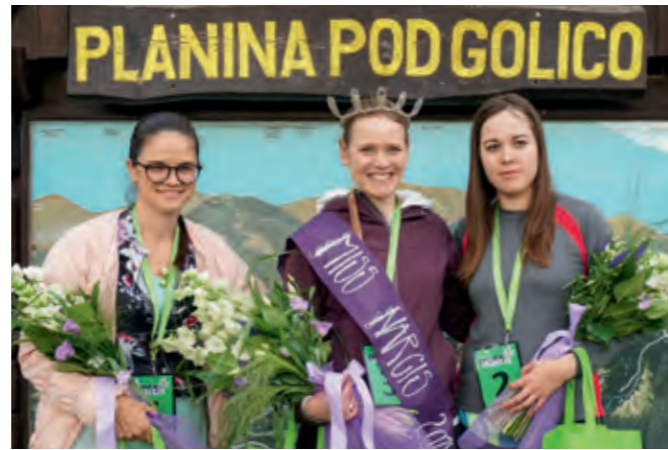
Prireditev Miss narcis v Planini pod Golico/ Event Miss off Daffodils in the village Planina pod Golico

Na Jesenicah se vsako leto odvijejo številne kulturne in športne prireditve, med katerimi so bolj znane: interkontinentalni pokal v sankanju na naravni progi v Savskih jamah (januar), tradicionalni sejem male obrti Jožefov sejem (15. do 19. marec) in po novem tudi sejem vsakega 19. v mesecu, mednarodno tekmovanje v umetnostnem drsanju Triglav Trophy (april), kresovanje na Golici (30. april), mesec narcis na Jesenicah (maj), Jesenice tečejo – en krog ali več (dobrodelni tek v maju), Kulturna mavrica Jesenic (junij), Poletje na Stari Savi (s kulturnim dogajanjem na prostem in poletno Torkovo kinoteko), Kmečke igre v Planini pod Golico (konec avgusta), Festeelval (september), Srečanje na Rožci (september), festival ljubiteljskih gledališč iz Slovenije in zamejstva Čufarjevi dnevi (november), tradicionalni novoletni koncert Pihalnega orkestra Jesenice – Kranjska Gora (december) in žegnanje konj na Blejski Dobravi (26. december).