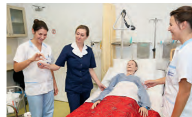
Fakulteta za zdravstvo Angele Boškin / The Angela Boškin Faculty of Health Care