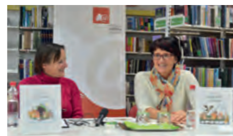
Knjižnica / Library