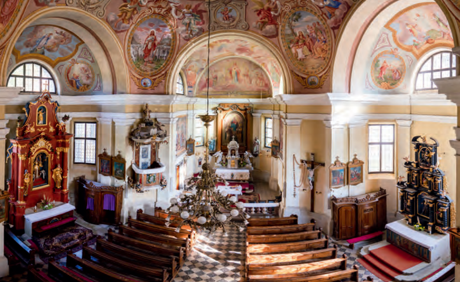
Cerkev sv. Ingenuina in Albuina na Koroški Beli / The Church of St. Ingenuinus and Albuinus in Koroška Bela