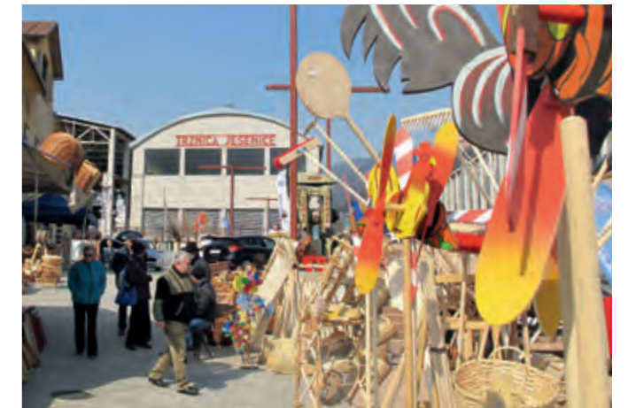
Jožefov sejem / St Joseph's Fair

Every year many cultural and sporting events take place in Jesenice – some of the most famous are the Intercontinental Cup in tobogganing on natural run in Savske jame (January), the traditional craft fair, St Joseph’s Fair (from 15 to 19 March) and now also a fair on every 19th day of the month, the Triglav Trophy international figure skating competition (April), Midsummer’s Day celebration on Golica (30 April), the month of daffodils in Jesenice (May), Jesenice Run – one running route or more (a charity event in May), the Jesenice Rainbow of Culture (June), the Summer in Stara Sava (with cultural events in the open air and the summer Tuesday cinema), the Farm Games in Planina pod Golico (end of August), Festeelval (September) Meeting on Rožca (September), the festival of amateur theatres from Slovenia and abroad Čufar’s Days (November), the traditional New Year’s Concert of Wind orchestra Jesenice – Kranjska Gora (December), and the blessing of horses in Blejska Dobrava (26 December).