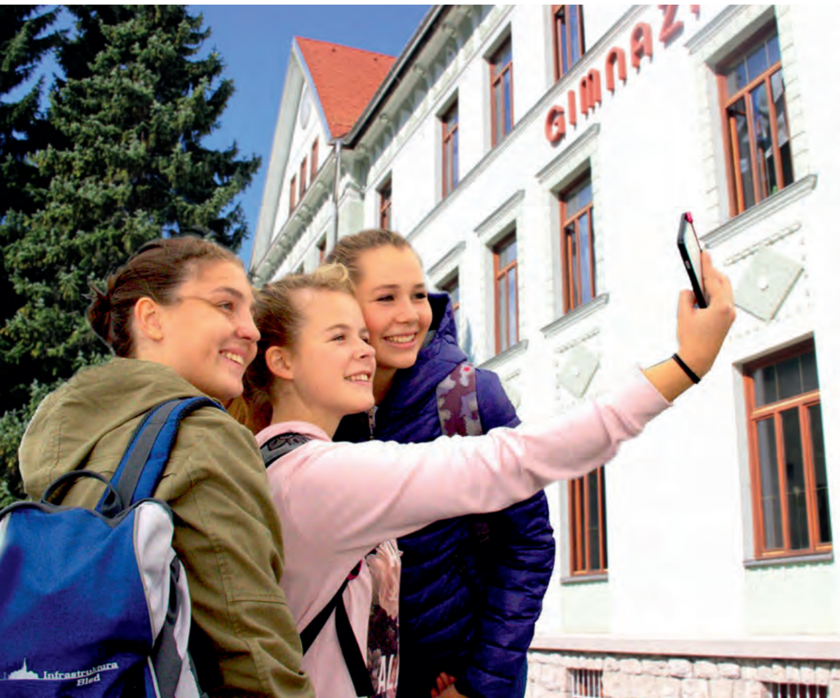
Gimnazija Jesenice / General upper secondary school Jesenice

“Na Jesenicah z znanjem, temelječim na tradiciji, ustvarjamo sedanost in gradimo prihodnost, se učimo celo življenje in z novimi znanji živimo boljše življenje.”