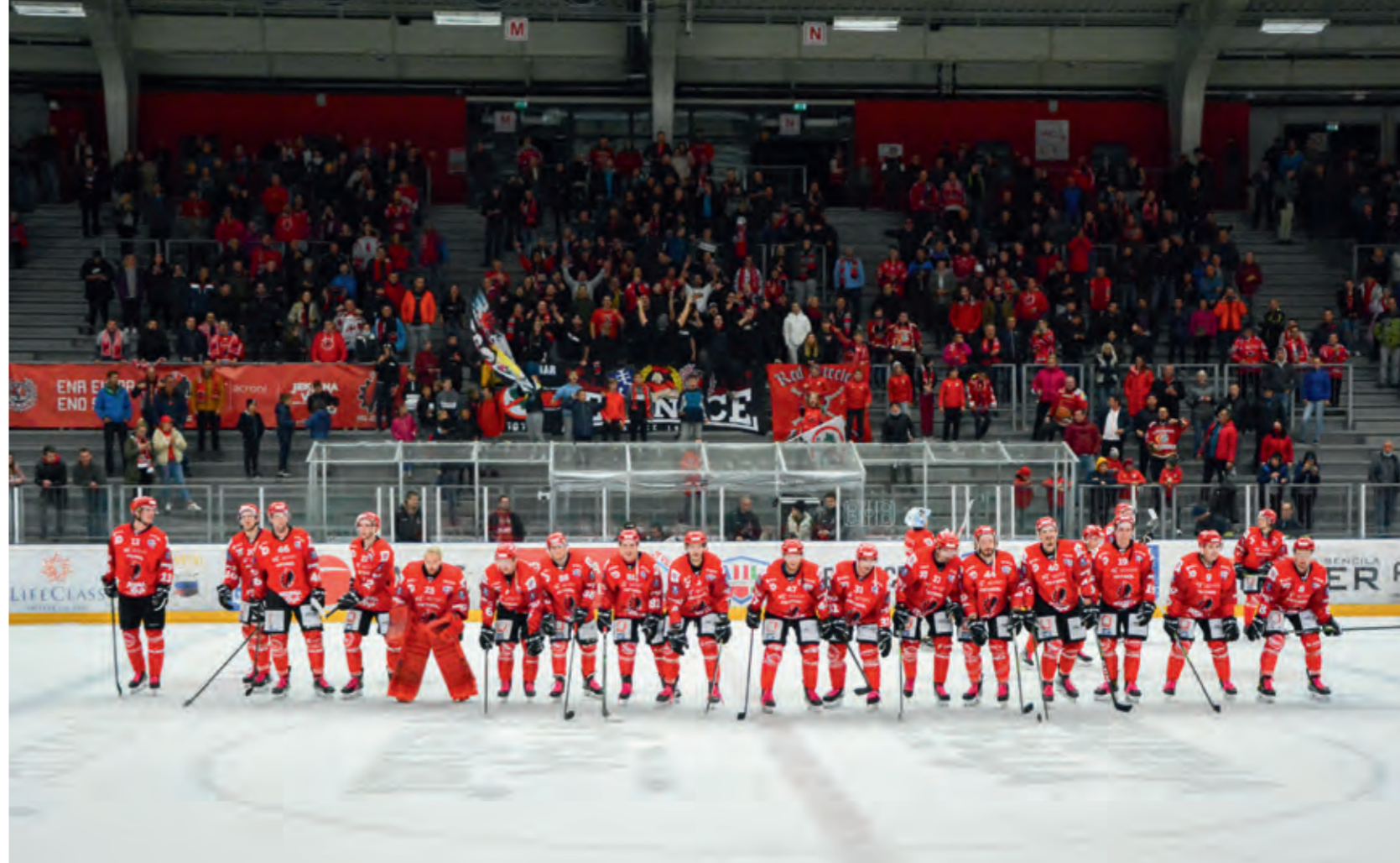
Jeseniški hokejisti / Hockey players of Jesenice