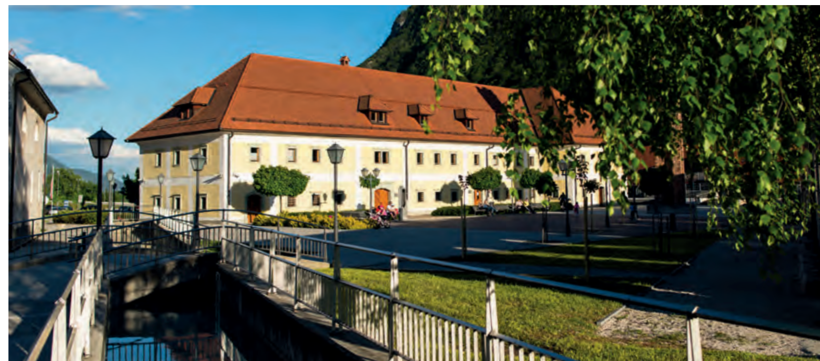
Rake / Water Channel