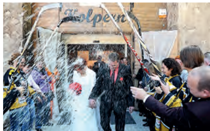
Banketna dvorana Kolpern / The Kolpern Backet Hall