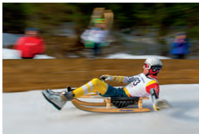
Naravna sankajska proga v Savskih jamah / Toboggan on natural run in Savske jame