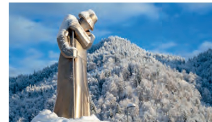
Kip železarja / A statue of a foundry worker

At the roundabout next to the administrative building, the symbol of modern architecture, one cannot overlook a two-and-a-half meter high statue of a foundry worker, as a tribute to one of the most difficult occupations.