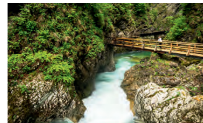
Soteska Vintgar / Vintgar Gorge