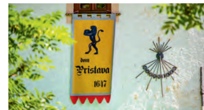
Planinski dom Pristava / Pristava mountain lodge

vacationers are welcomed. Accommodation facilities are also offered at Blejska Dobrava and Kočna; mountaineers also have the opportunity to spend the night in the Pristava mountain lodge at Javorniški Rovt (975 m) or mountain lodge on Golica (1,582 m).