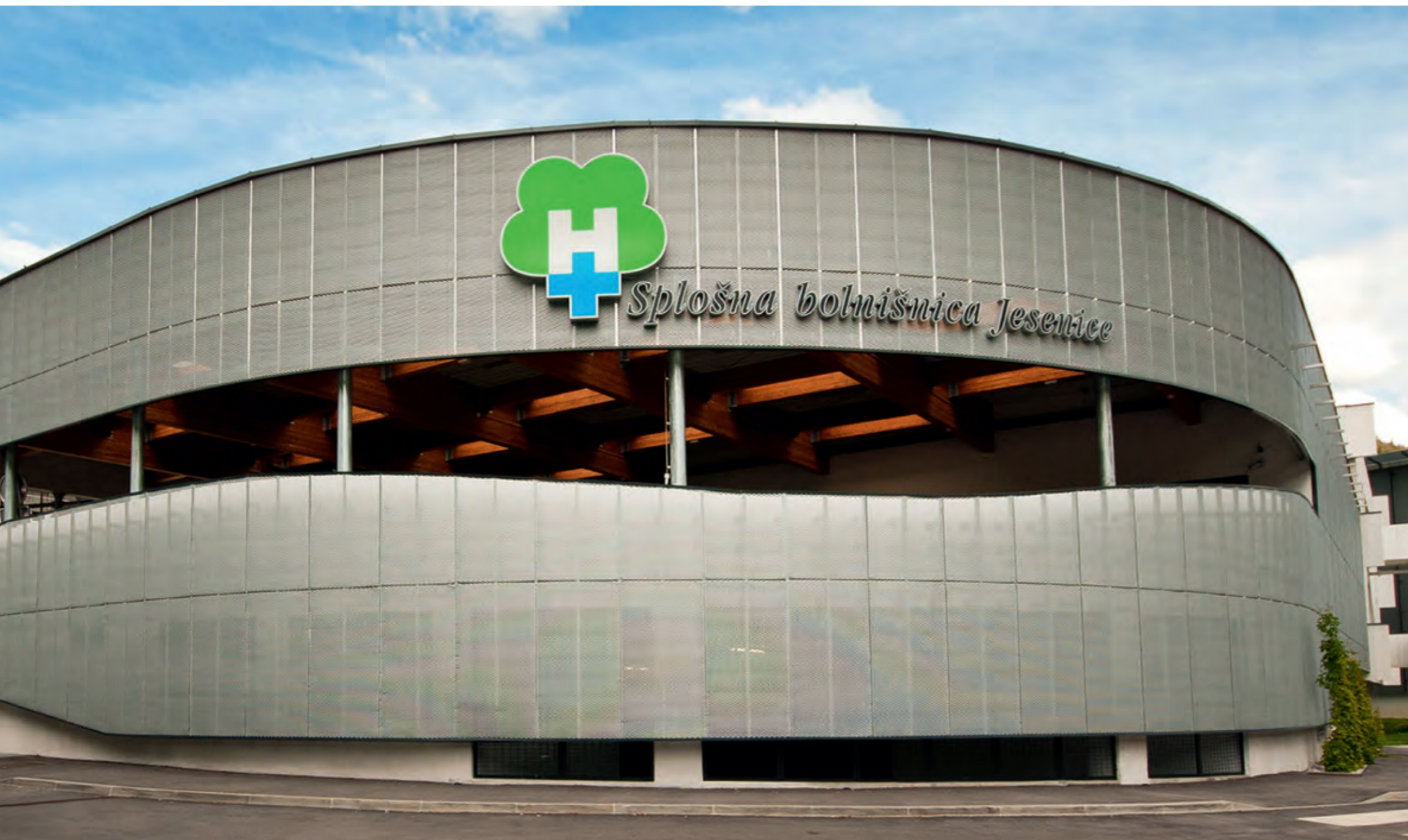
Splošna bolnišnica Jesenice / The Jesenice General Hospital