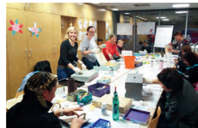
Ljudska univerza Jesenice / Jesenice People's University

Od prve obvezne šole v mestu sta minili več kot dve stoletji (1814). Danes imajo Jesenice tri osnovne, podružnično šolo na Blejski Dobravi, osnovno šolo s prilagojenim programom, glasbeno šolo, Gimnazijo Jesenice s splošnim in športnim programom ter Srednjo šolo Jesenice za nižje in srednje poklicno izobraževanje za področja strojništva, zdravstvene nege in vzgojiteljskega programa. Od leta 2007 ima mesto Fakulteto za zdravstvo Angele Boškin s široko paleto študijskih programov: večstopenjskim študijem zdravstvene nege, fizioterapije, promocije zdravja, doktorskega