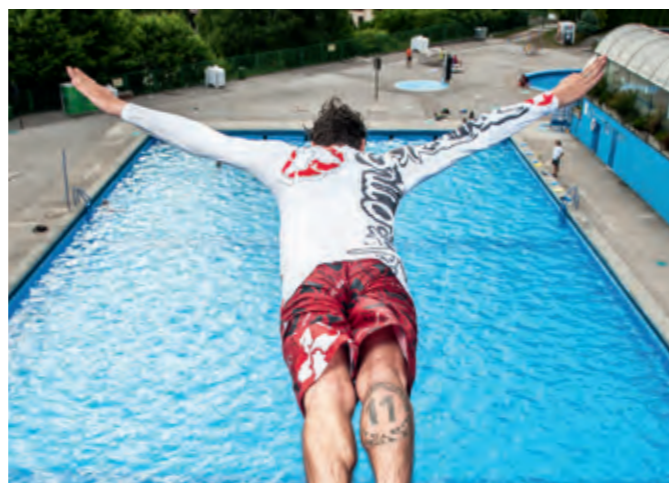
Kopališče Ukova / Swimming pool Ukova