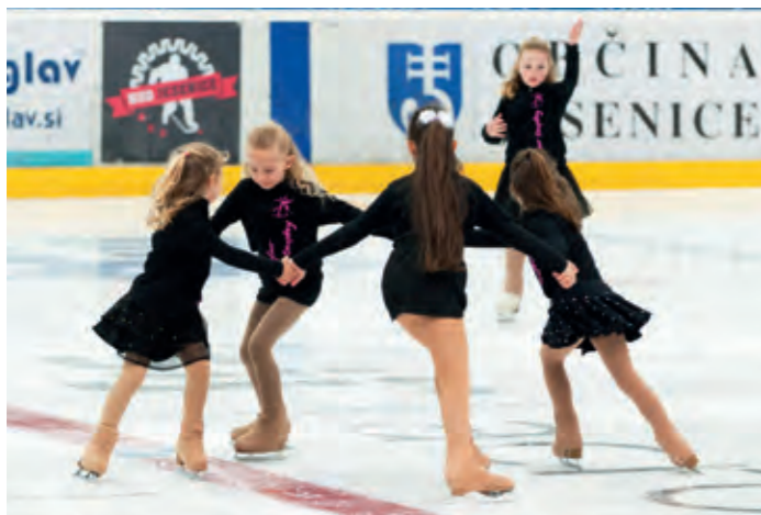
Tekmovanje v umetnostnem drsanju Triglav Trophy / The Triglav Trophy international figure skating competition