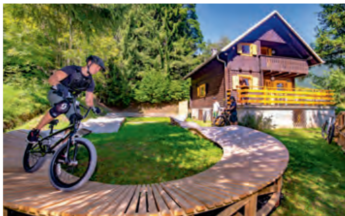
GKUC Pristava v Javorniškem Rovtu / Javorniški Rovt - MTB Centre Pristava