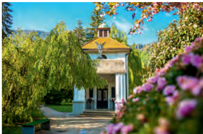
Spominski park Jesenice / Jesenice Memorial park