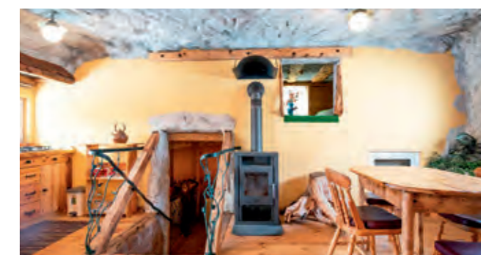
Klub Zlata ribica