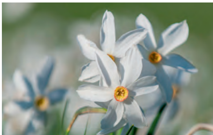
Ključavnice / Daffodils