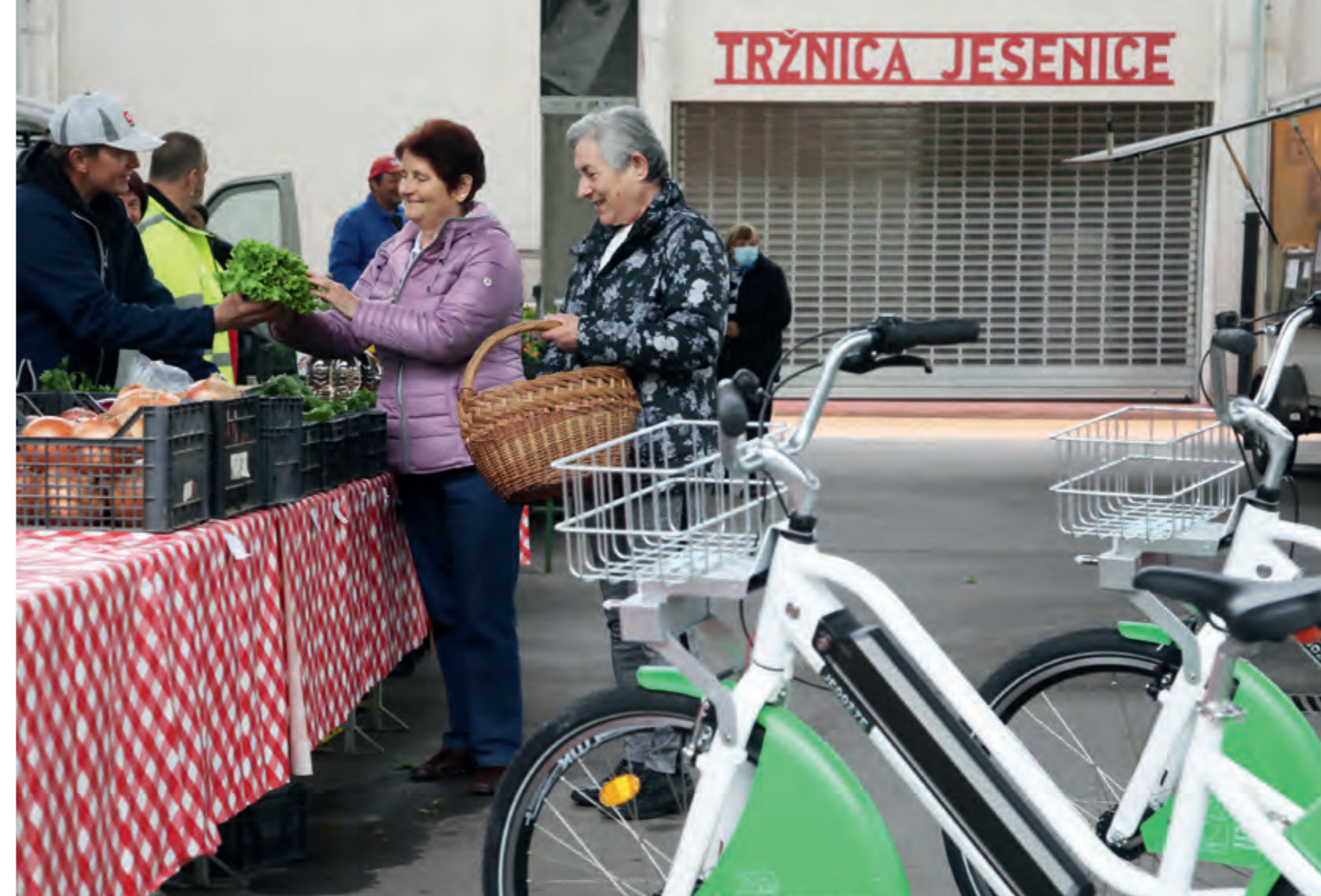
Tržnica Jesenice / Market Jesenice

Karmen z Jesenic, obiskovalka Tržnice Jesenice