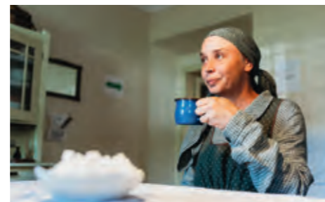
Muzej / Museum