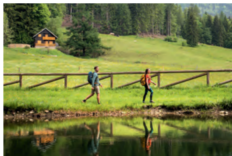
Zoisov park / Zois' park